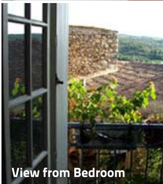
View from Bedroom